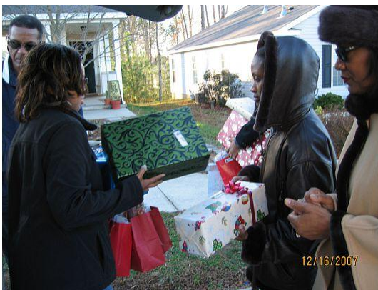
Christmas Cheer at The Caring Place