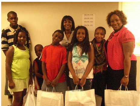
Kids Café School Supplies