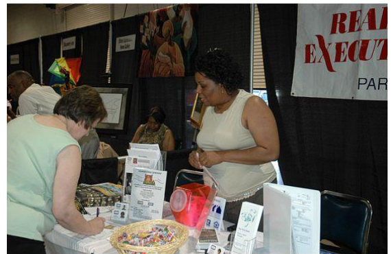
Minority Business Expo