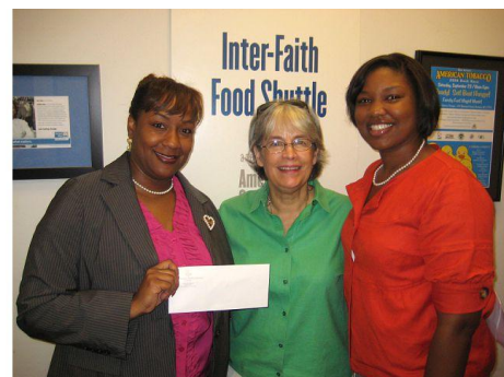
Interfaith Food Shuttle Backpack Buddies